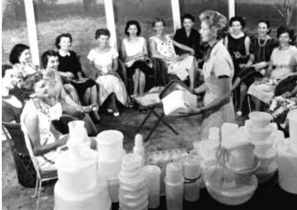
TUPPERWARE (1958)

BEHOLD THE POWER of authority. Certainly not lost on the National Rifle Association is that the authority inherent in such heroic figures as Moses, El Cid and Ben-Hur is linked to the actor who portrayed them, Charlton Heston.